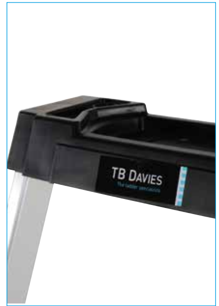
Integrated tool tray