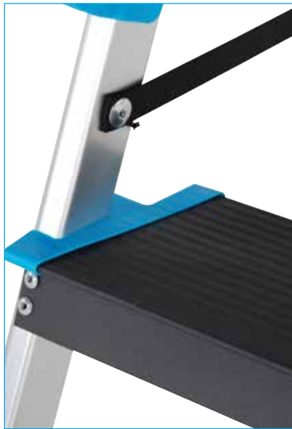
Extra-large 120mm anti-slip treads with edge protection