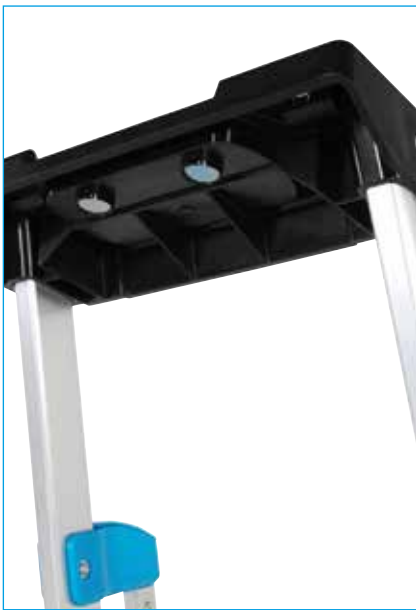
Magnets integrated to keep hold of loose screws