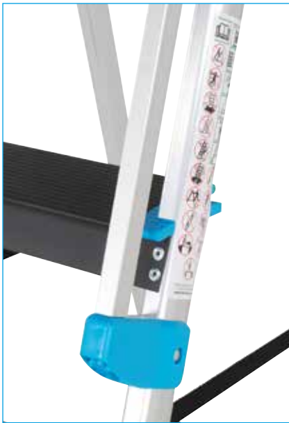
Twin safety handrails to assist with climbing