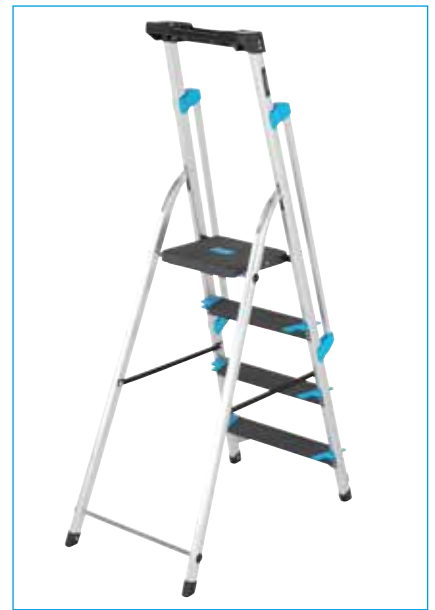
Lightweight and durable step ladder