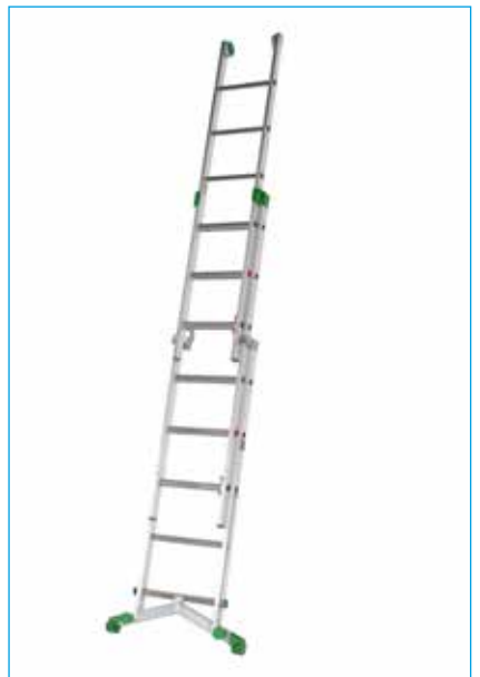
3-Section extension ladder