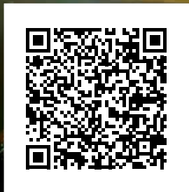
*Product Web Page