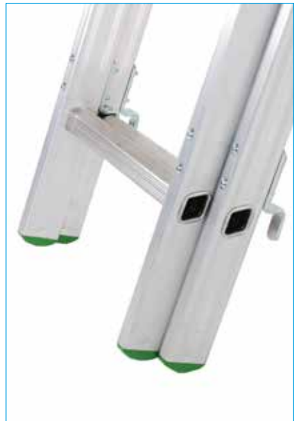
Large box section stiles with twist-proof rung connections