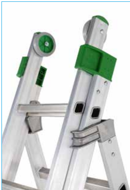
Integrated wall wheels to assist in placement