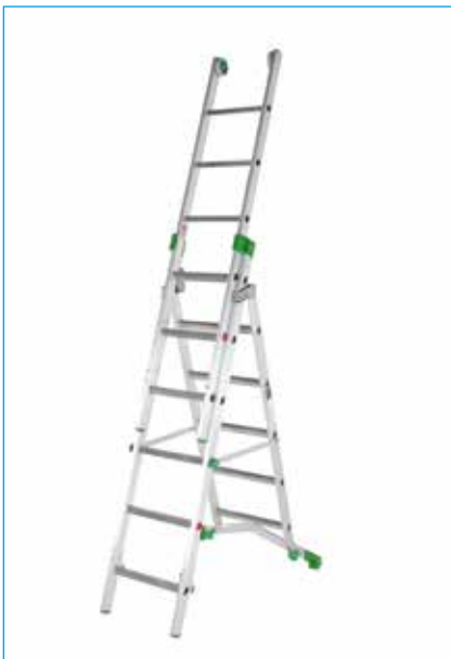
Extended A-frame step ladder