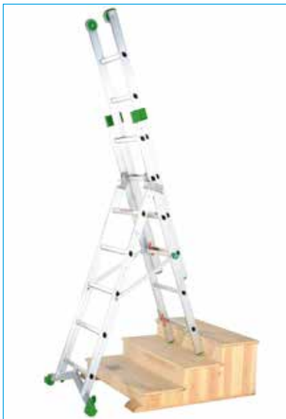
Extended stairwell ladder