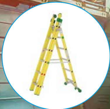
*Fibreglass version available