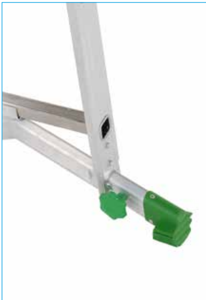
Telescopic stabiliser for use on uneven ground