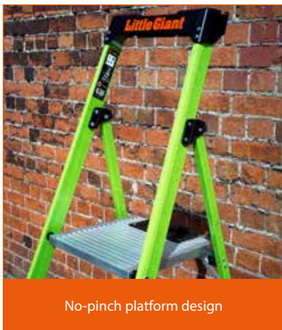
No-pinch platform design