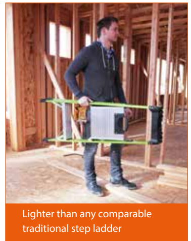
Lighter than any comparable traditional step ladder