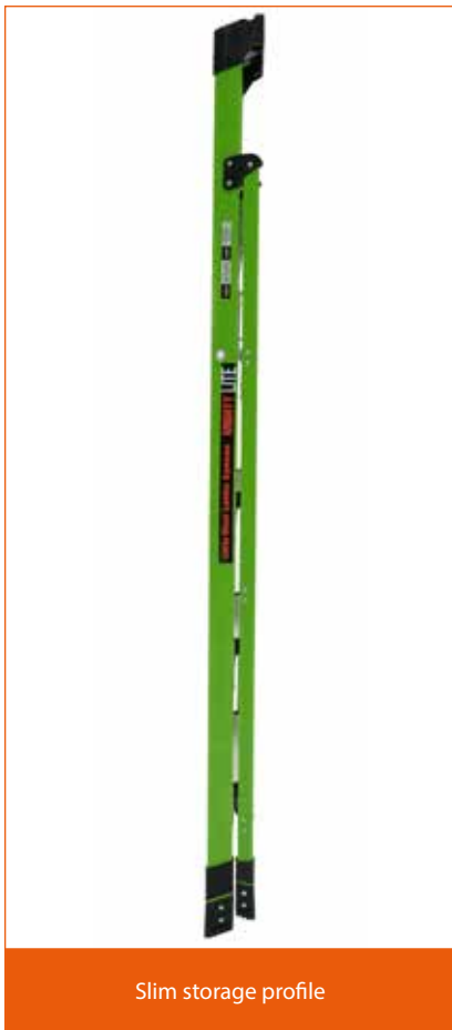
Slim storage profile