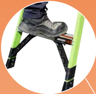
Ground Cue™ indicator alerts user to last step